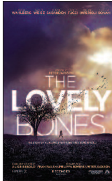
THE LOVELY BONES ★ FRI., 11/27, 5:00pm THE LOVELY BONES ★ MON., 12/28, 7:30pm