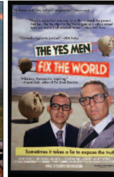
THE YES MEN FIX THE WORLD Sunday, Jan. 3, 7:30pm

Treat Yourself and Those You Love This Holiday Season!