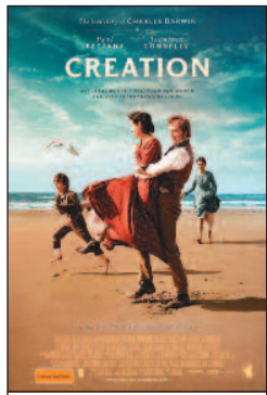
CREATION Tuesday, Dec. 29, 7:30pm

FirstLight: The Maui Film Festival's 11th Annual Celebration of Cinema™