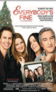
EVERYBODY'S FINE Wednesday, Nov. 25, 7:30pm

12 of the 38 FirstLight: Academy Screenings on Maui™ Feature Films.