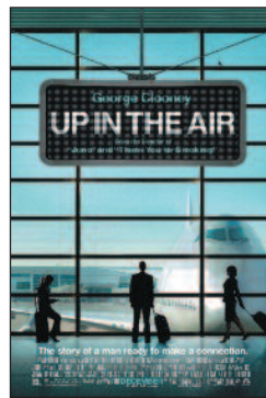
UP IN THE AIR Friday, Nov. 27, 7:30pm