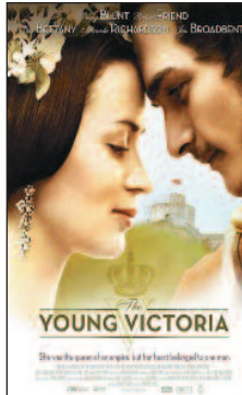
THE YOUNG VICTORIA Wednesday, Dec. 16, 7:30pm