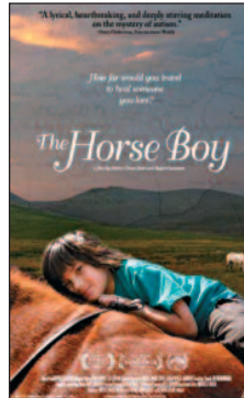
THE HORSE BOY Sunday, Jan. 3, 5:00pm