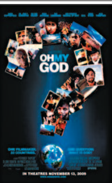
OH MY GOD Tuesday, Dec. 22, 7:30pm