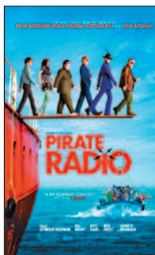
PIRATE RADIO Saturday, Dec. 26, 5:00pm