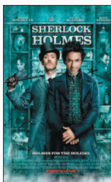
SHERLOCK HOLMES Wednesday, Dec. 23, 7:30pm