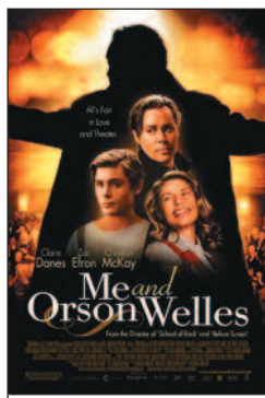
ME AND ORSON WELLES Sunday, Dec. 27, 7:30pm

What's New? Please Join Our Facebook and Email 'Ohana Today Visit: MauiFilmFestival.com