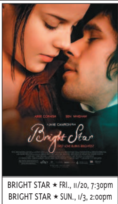
BRIGHT STAR ★ FRI., 11/20, 7:30pm BRIGHT STAR ★ SUN., 1/3, 2:00pm

Best Films of the Year★ Best Time of the Year★ Hope to See You There★