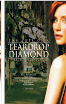
THE LOSS OF A TEARDROP DIAMOND Friday, Dec. 18, 7:30pm