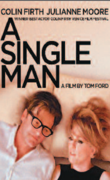
A SINGLE MAN Sunday, Dec. 27, 5:00pm